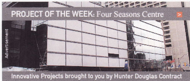
Innovative Projects brought to you by Hunter Douglas Contract